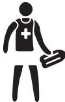
Join the Swim Team.