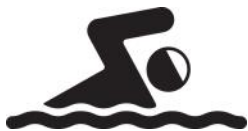
Join the Swim Team.