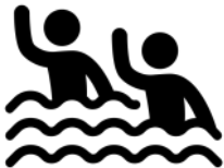
Become a Water Exercise Instructor.